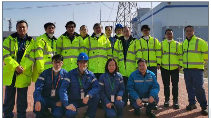
The SNPSC ISI team conducted the Unit 2 steam generator ISI in just 12 days

"The use of Zetec probes, robotics, test instruments, and software as an integrated system helped us optimize planning, calibration, data acquisition, and human exposure to radiation. The technology helped us build on the success of our Unit 1 steam generator ISI to finish five days ahead of schedule on Unit 2 while achieving our goals for safety, accuracy, and plant downtime."