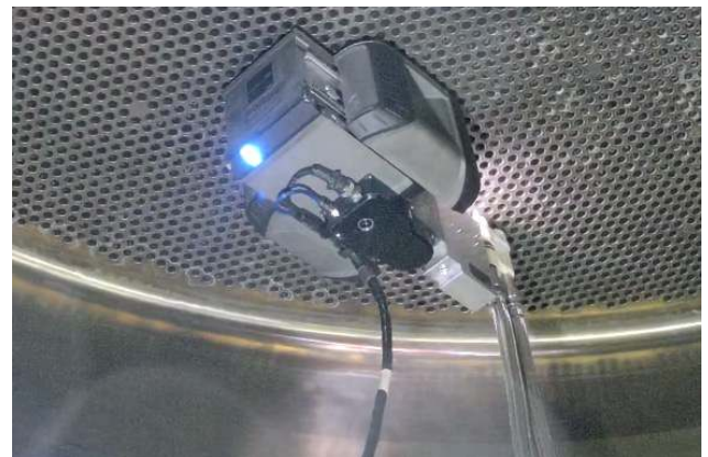
This is the first time the ZR-100 has been used for steam generator ISIs in China